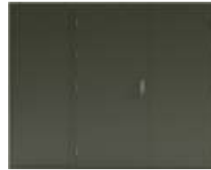
Double Doors and Side Panel