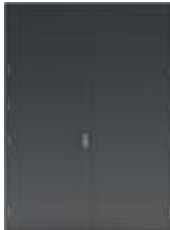
Double Doors and Over Panel