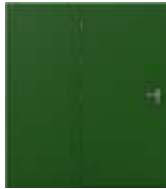
Single Door and Side Panel