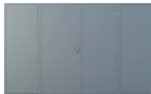
Double Doors and 2 Side Panels