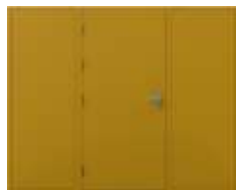
Single Door and 2 Side Panels