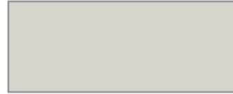
RAL 9002 Grey White