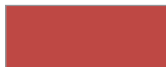
BS 04 E 53 Poppy Red