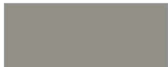
RAL 7030 Stone Grey