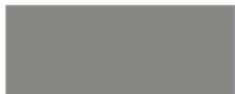
RAL 9007 Grey Aluminium