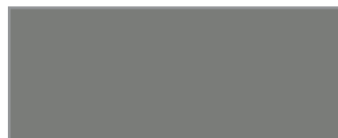
RAL 7037 Dusty Grey