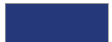
RAL 5002 Ultramarine Blue