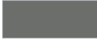
RAL 7005 Mouse Grey