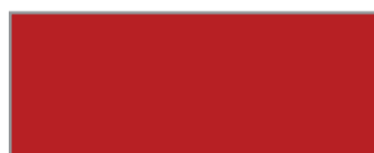
RAL 3020 Traffic Red