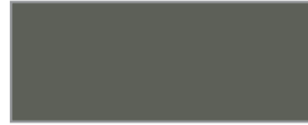
RAL 7009 Green Grey