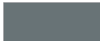
BS 18 B 25 Merlin Grey