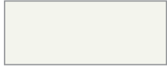
RAL 9016 Traffic White

Our standard colour range is below; warranted against corrosion for two years. Enhanced PPC finishes are available for C4 and C5 applications, and we're happy to finish in non-standard colours too - please contact our Sales Team for further information.