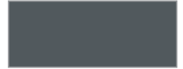
RAL 7011 Iron Grey