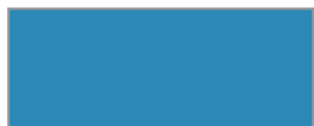
RAL 5012 Light Blue