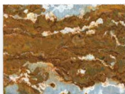
Galvanised Steel 20 µm after 6 weeks

By comparing Magnelis® alongside galvanised steel, from our 1000-hour salt spray test, the results clearly demonstrated that Magnelis® resists corrosion for much longer than standard galvanised products.