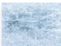
Magnelis® 20 µm after 34 weeks