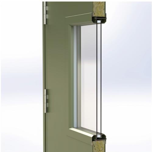
Minimum zone of visibility

Standard Vision Panels - max size 508x1524mm per leaf. Please contact Sales for other options.