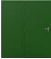
Single Door and Side Panel