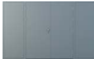
Double Doors and 2 Side Panels