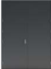
Double Doors and Over Panel