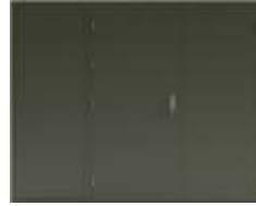
Double Doors and Side Panel